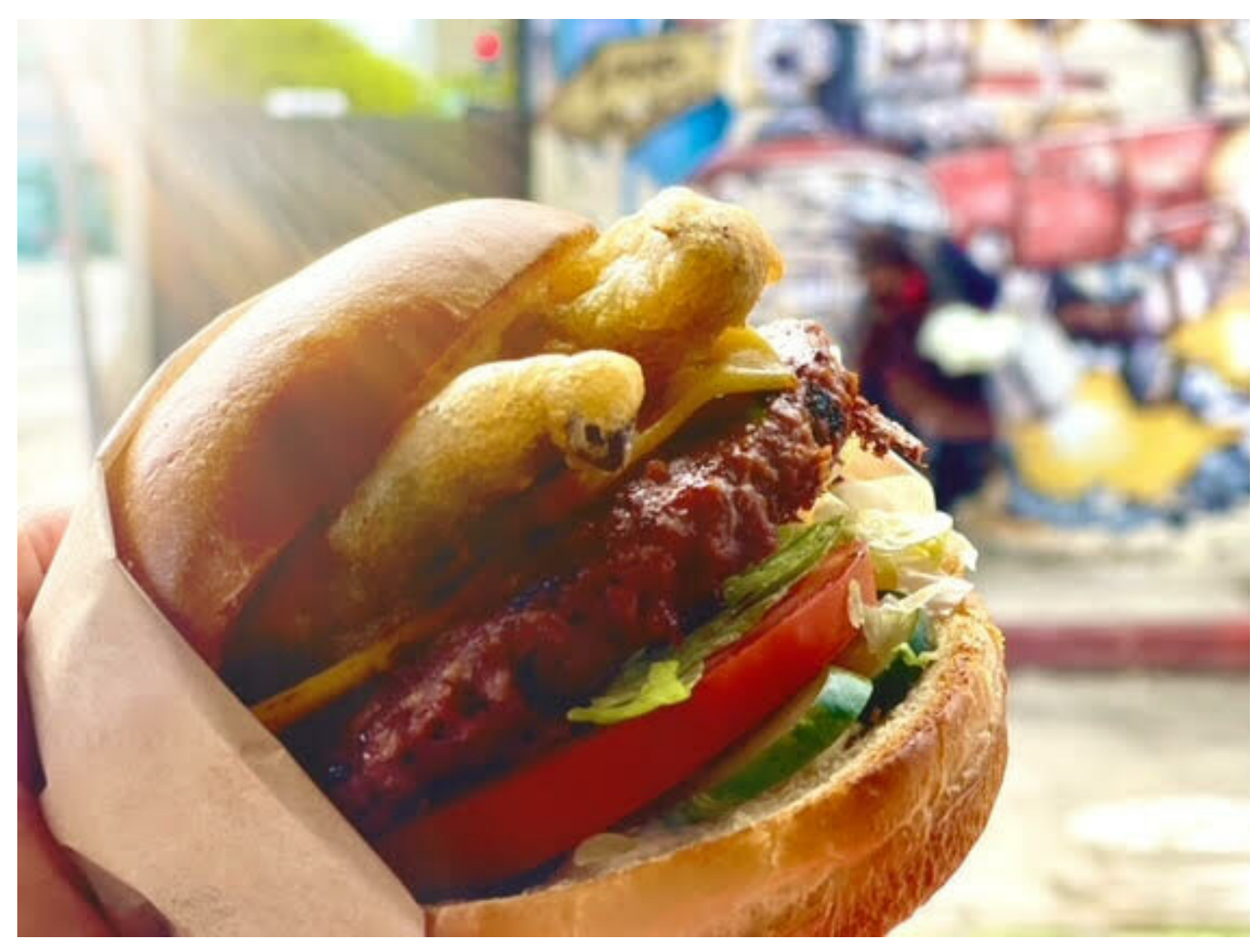
In this flle photo: The Works burger at Sideburns in Alamitos Beach. Sideburns is one of 22 participating restaurants in the Long Beach Burger Week promotion which will be on Aug. 7-14.