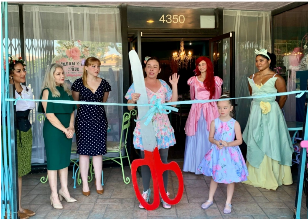
The Dream Come True Tea Time crew cuts the ribbon for its new home in Bixby Knolls.