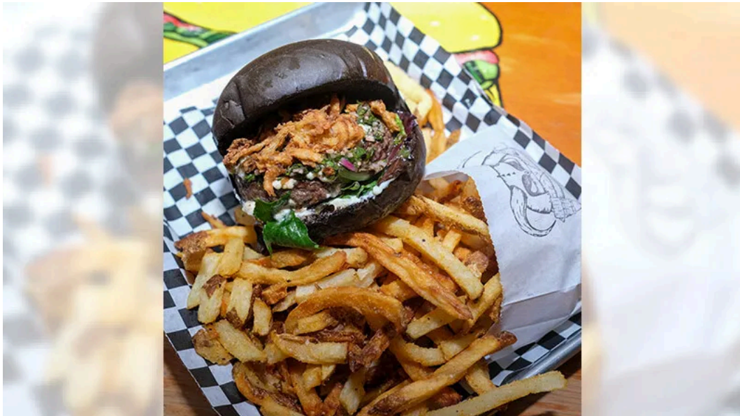
The Ozzy Osbourne burger by Grill 'Em All is served on a black bun and will be part of deals offered during Long Beach Burger Week.